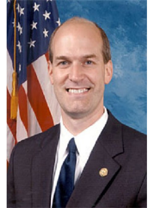
Rep. Rick Larsen