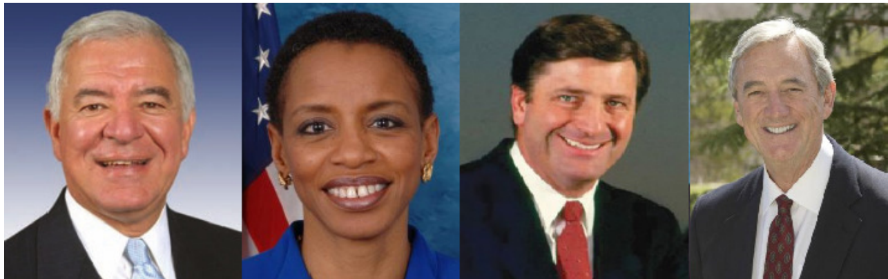
Rep. Nick Rahall